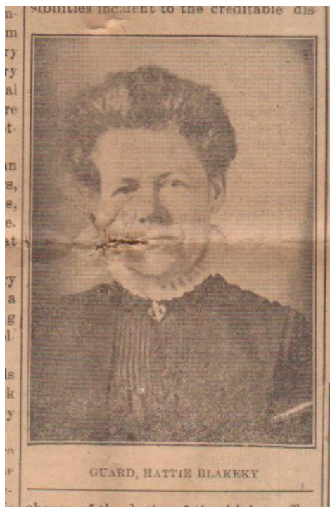
September 1, 1909, The Enterprise, Evansville, Wisconsin