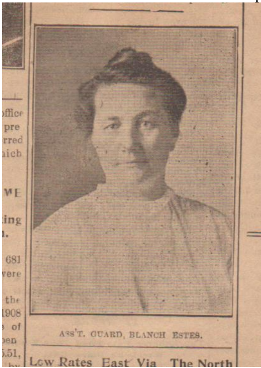
September 1, 1909, The Enterprise, Evansville, Wisconsin