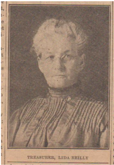
September 1, 1909, The Enterprise, Evansville, Wisconsin