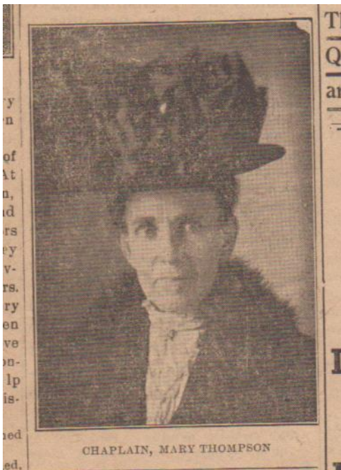
September 1, 1909, The Enterprise, Evansville, Wisconsin