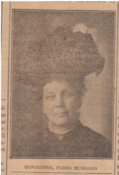
September 1, 1909, The Enterprise, Evansville, Wisconsin